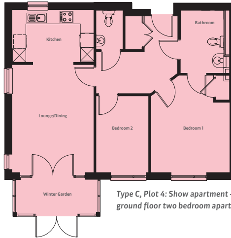
Type C, Plot 4: Show apartment - ground floor two bedroom apartment