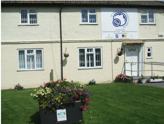
Community House Launch 2005