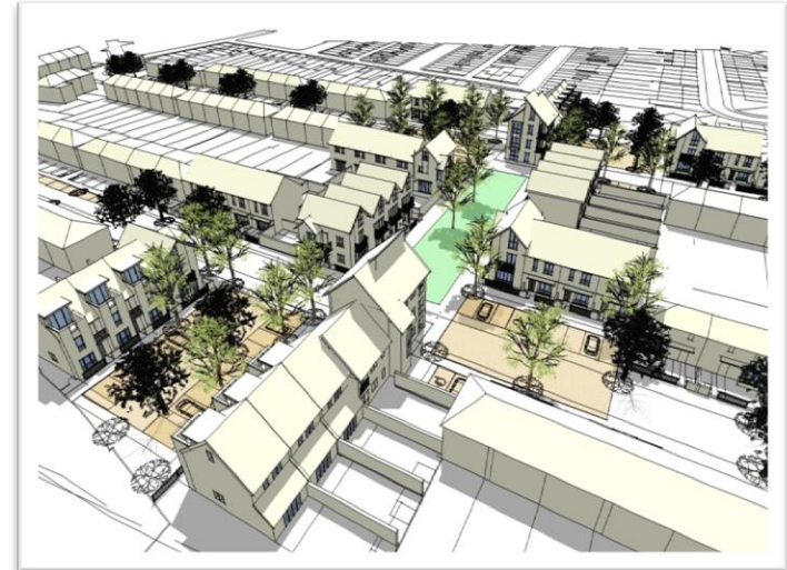
Planning for Real