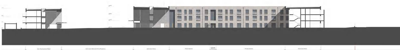
08 WEST ELEVATIONAL SECTION C OVER 55'S APARTMENT BLOCK AND EXTRA CARE HOME