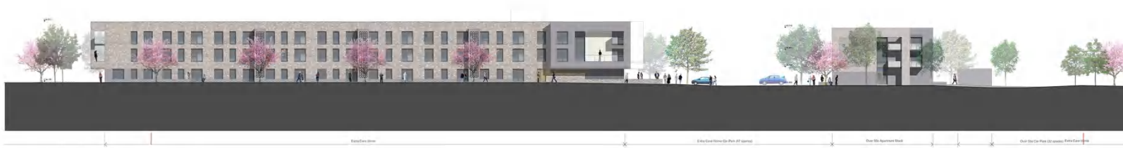
06 EAST ELEVATION OVER 55'S APARTMENT BLOCK AND EXTRA CARE HOME