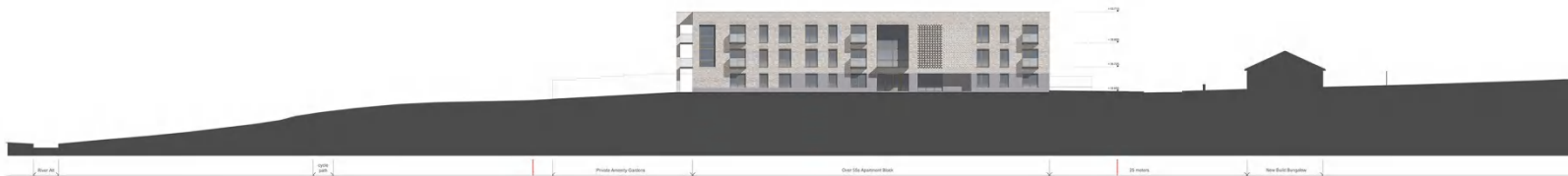
10 SOUTH ELEVATION OVER 55'S APARTMENT BLOCK