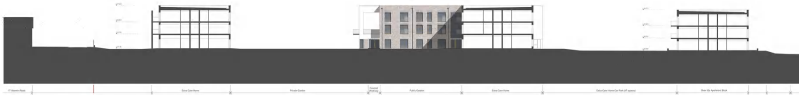
09 EAST ELEVATIONAL SECTION A OVER 55'S APARTMENT BLOCK AND EXTRA CARE HOME