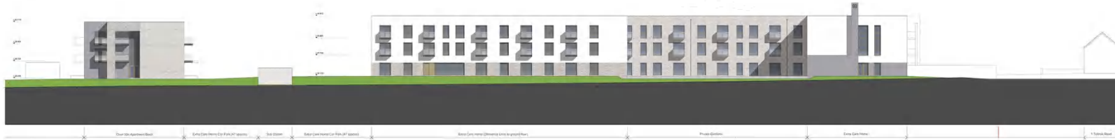
07 WEST ELEVATION OVER 55'S APARTMENT BLOCK AND EXTRA CARE HOME