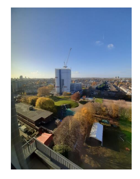
Walter Tull House: Bespoke Housing programme Target: 6 Engage: up to 6 for deployment