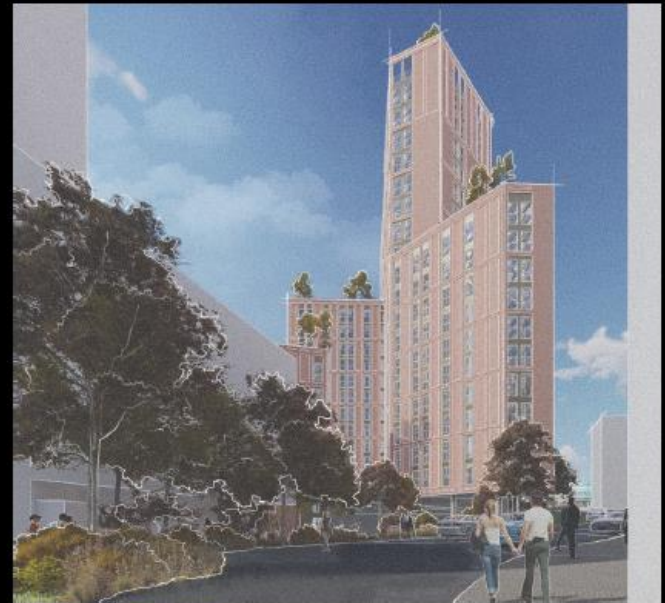
→ View along Piccadilly