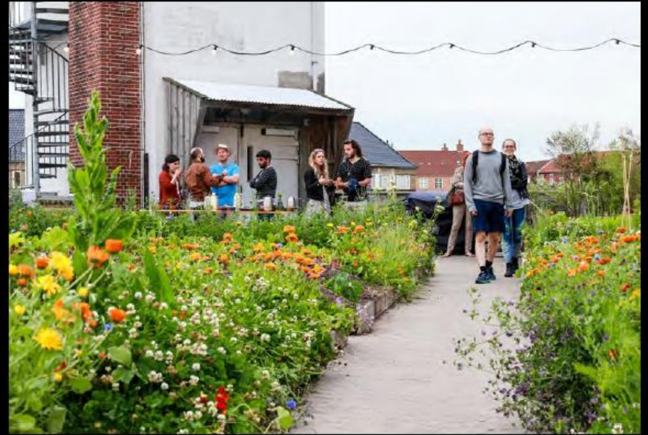
Inspiration → ØsterGro / Copenhagen