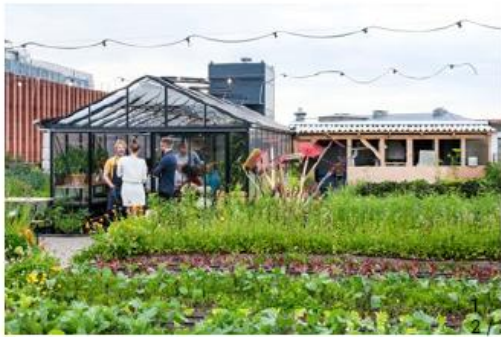
→ Inspiration → ØsterGro / Copenhagen → Picture This → Stockport

We want the building to encourage movement, so stairwells will have windows and feel bright and welcoming. We will also design space that can be used to exercise.