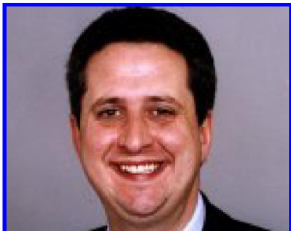
Ivan Lewis MP, Parliamentary under Secretary of State for Care Services