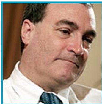
Stephen Ladyman MP Parliamentary Under Secretary of State for Community Care (PS(C))