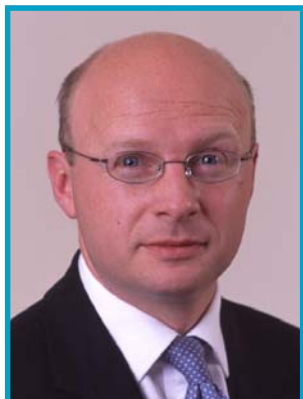
Liam Byrne MP Parliamentary Under Secretary of State for Care Services