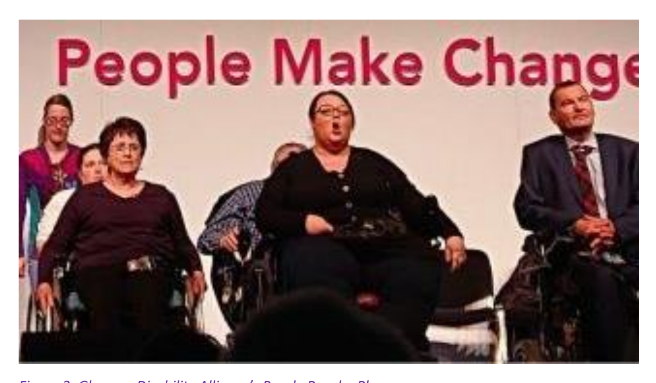
Figure 2: Glasgow Disability Alliance's Purple Poncho Players

I was able to call on the experience that I've gathered over the years as a member of the Purple Poncho Players (a theatrical wing of Glasgow Disability Alliance). We use drama sketches, music and poetry to get across key messages around disability. The advantage of using this approach is to disarm your audience. I'm sure you've all been there when you listen to a presentation and it's death by PowerPoint, whereas when you use drama, music and poetry, you get your message across.