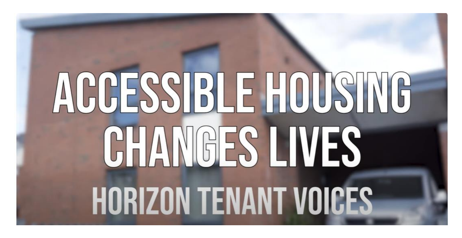
Figure 3: Horizon Accessible Housing Short v1

My name is Chris Baird, and I want to share inspiring stories of individuals whose lives have been transformed by living in accessible social housing. I have the pleasure today to introduce to you a short film, Accessible Housing Changes Lives, so without any further ado I would ask you to sit back and enjoy the film: