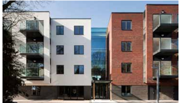
High quality and attractive accommodation for older people providing 100% affordable housing.

Completed HAPPI Winner, Housing Design Award 2011 Winner Best Design, Housebuilder Awards 2011