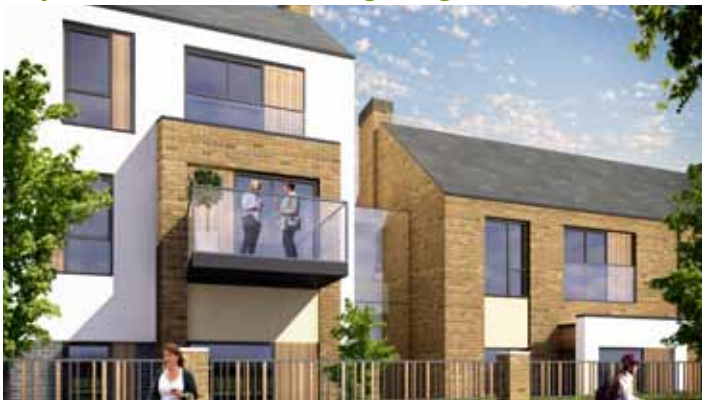
The majority of apartments have a generously proportioned private external balcony or terrace.

Project HAPPI Winner, Housing Design Award 2011