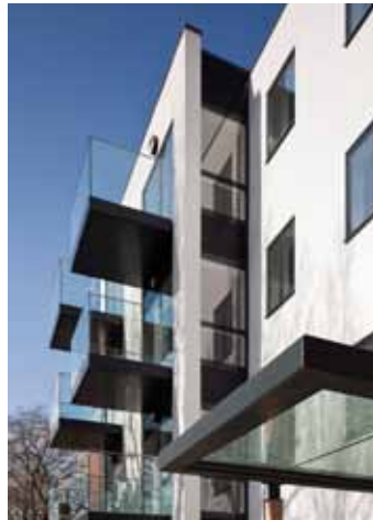
Private balconies to all apartments with enough space for table, chairs and plants.