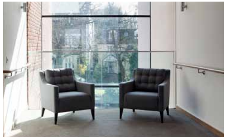
The circulation areas are designed as meaningful shared spaces encouraging casual social interaction. The communal and circulation areas maximise the use of natural light.