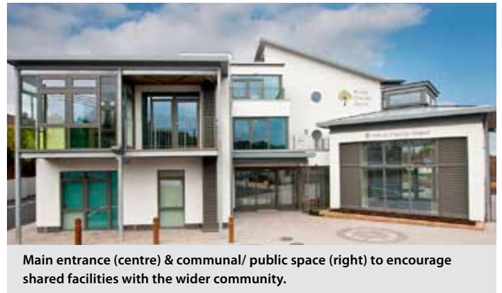
Main entrance (centre) & communal/ public space (right) to encourage shared facilities with the wider community.