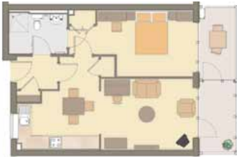
Typical flat plan showing open plan design. All flats have balconies with the south facing flats benefitting from winter gardens (see below).

Shortlisted for a Housing Design Award 2012