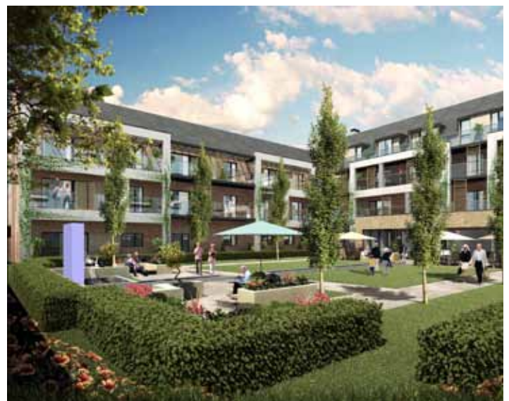
There are five separate external communal areas which includes a main communal garden, residents sensory garden / activity garden for horticultural projects and an intimate cloister garden which is at the rear of the existing buildings where there is also open deck access to the apartments. A large atrium space is located close to the resident's lounge creating a vibrant and naturally lit communal space at the heart of the scheme.