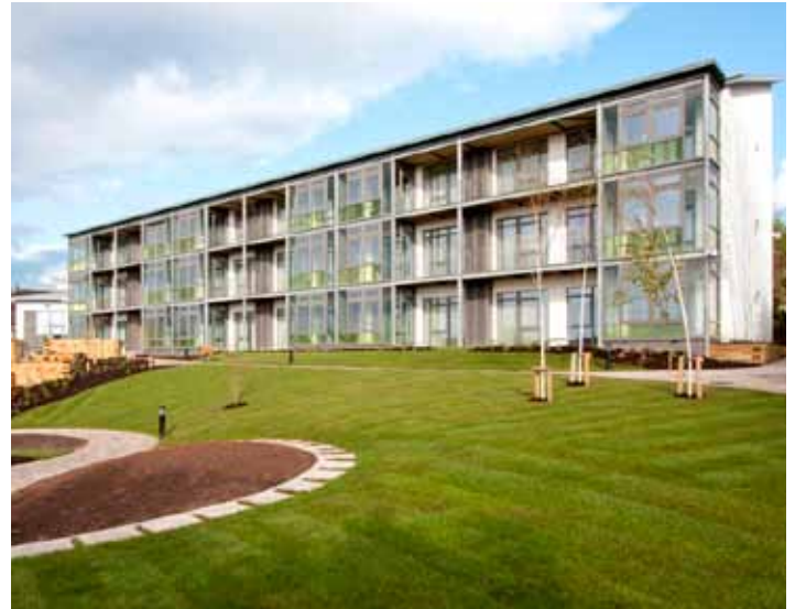
Winter gardens & balconies (south facing).