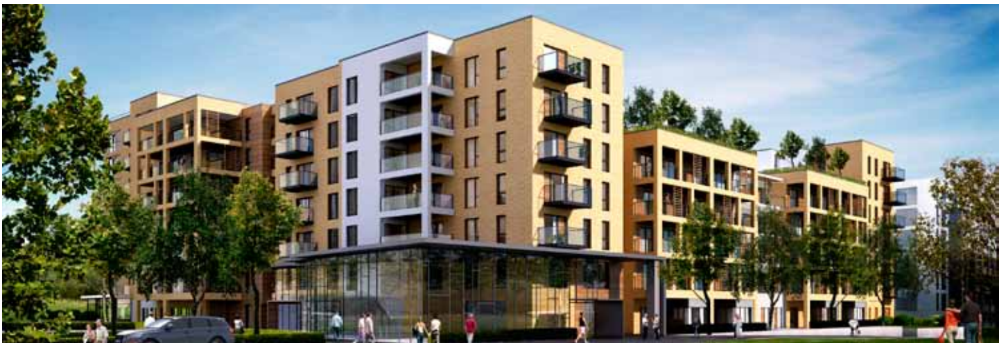
The attractive contemporary design provides generous sheltered balconies to all apartments, many of which are dual aspect. Extensive communal facilities are provided at the ground floor which are designed to enable access by the wider community to create a 'community hub'.

Client: Berkeley Homes Urban Renaissance