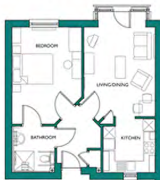
Typical one bedroom flat 52 sq m