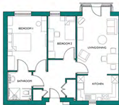
Typical two bedroom flat 65 sq m