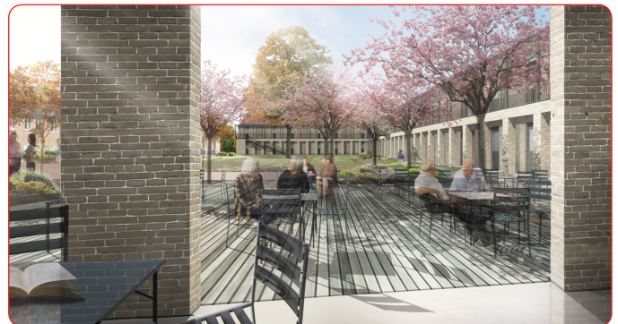
Architect's image of the new assisted living scheme in Evington

The flats meet all the criteria of the Housing our Ageing Population Panel of Innovation (HAPPI) report. In addition, careful attention has been given to the landscaping, which focuses around a large mature Lime tree surrounded by a formal lawn at its centre. The garden design has an oriental theme incorporating a sequence of distinctive garden spaces including a shaded moss garden, water terrace and acer grove. For further details, visit: www.prparchitects.co.uk