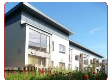
Heysham Gardens, Carlisle

www.housinglin.org.uk/Topics/ECHScheme/search/Overview/?cid=8314