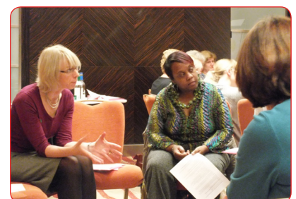
Workshop at the Housing LIN Extra Care Housing Conference