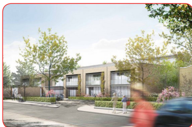
The Oaks, LB of Merton

And finally, The Oaks, a sheltered housing scheme managed by Merton Priory Homes in LB Merton, was shortlisted for this year's HAPPI award for its plans by PRP