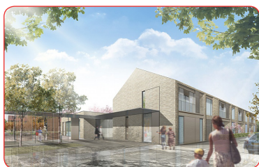
Pilgrim Gardens, Evington