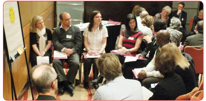
Workshop at the Housing LIN Extra Care Housing Conference

To register, visit: www.tetlow-king.co.uk