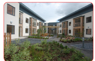
Heysham Gardens, Cumbria