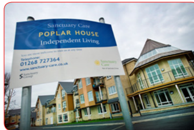
Poplar House, Basildon

A new scheme in Pitsea for the over-55s, funded jointly by Sanctuary, Essex County Council and Basildon Council, which we featured in the April newsletter, had its official