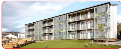
Prince Charles House, St Austell