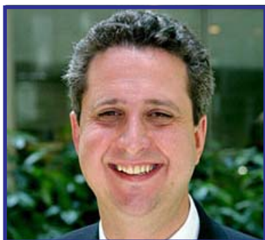
Ivan Lewis MP, Parliamentary under Secretary of State for Care Services