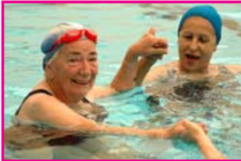
EAC positive images of older people www.housingcare.org