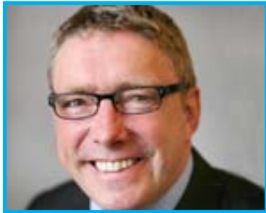
Phil Hope - Minister of State for Social Care