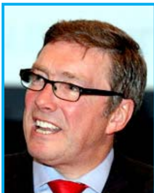
Phil Hope - Minister of State for Social Care