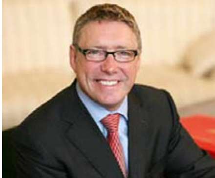
Phil Hope - Minister of State for Social Care