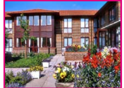
Richard Neve House

These, along with other schemes funded by the DH, will feature next year in a new Housing LIN on-line directory of DH funded ECH schemes.