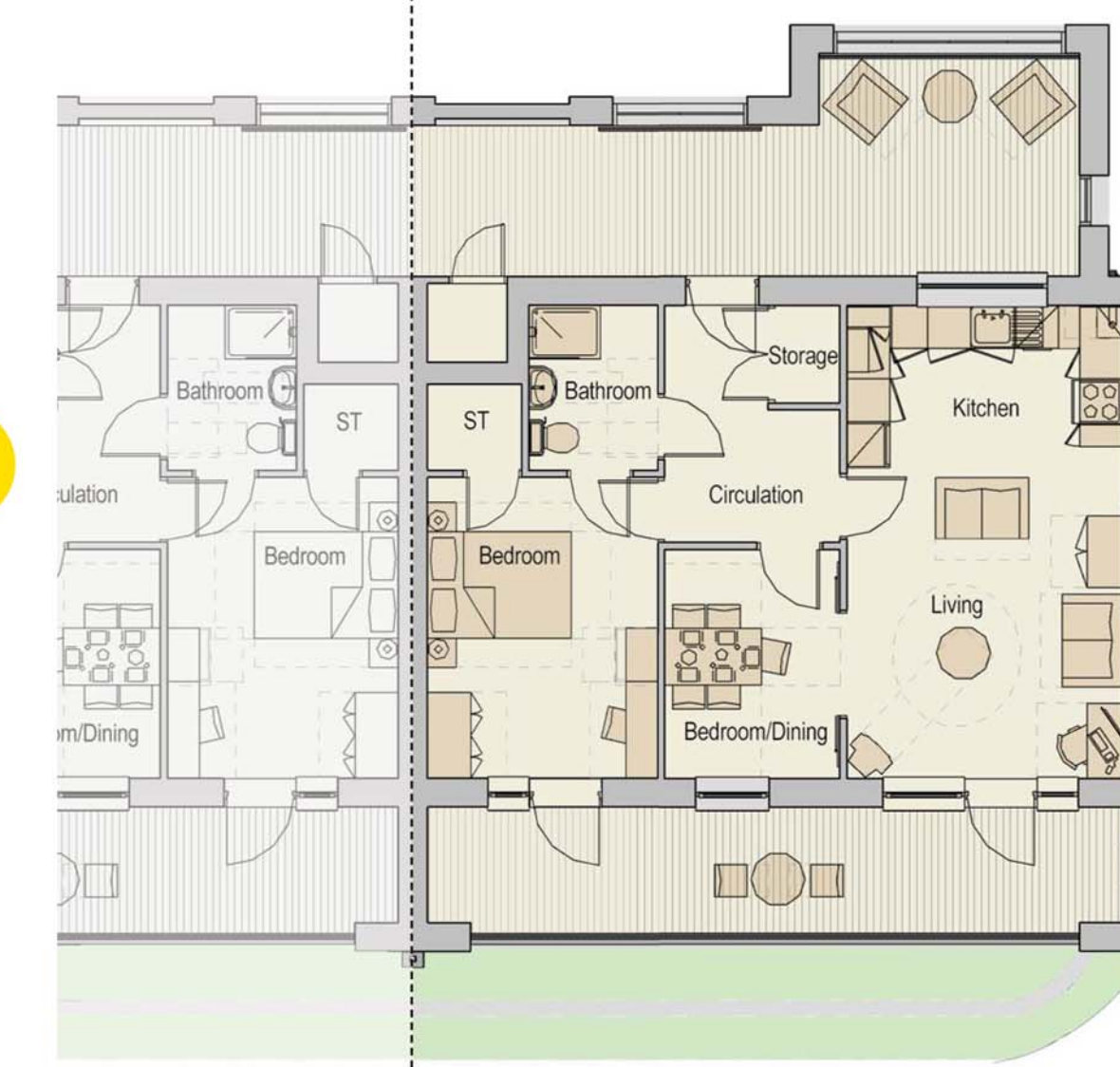
Typical 2Bedroom/3Person Floor Plan @ 1:100