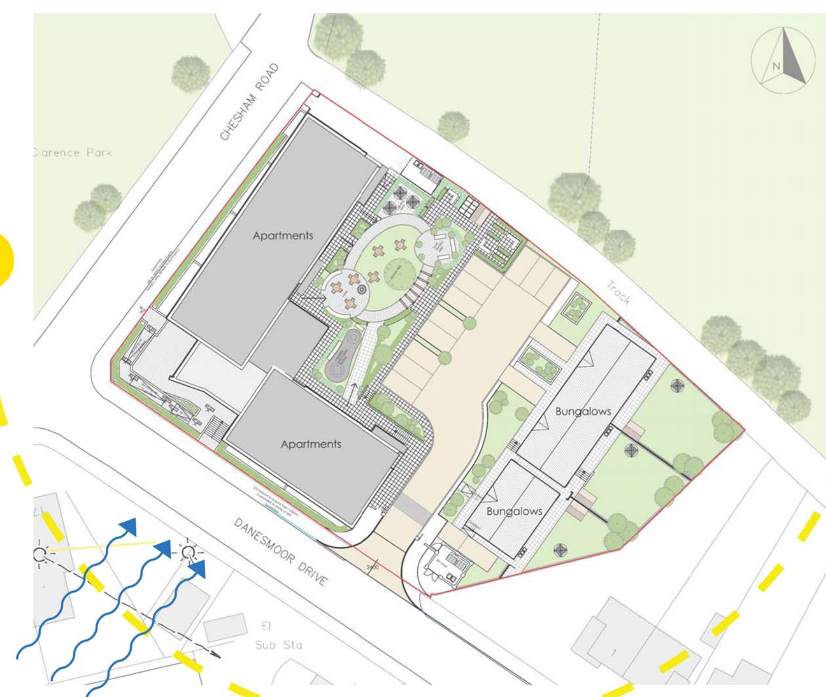
Site Plan @ 1:500